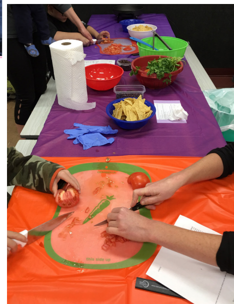
Family Cooking Night.