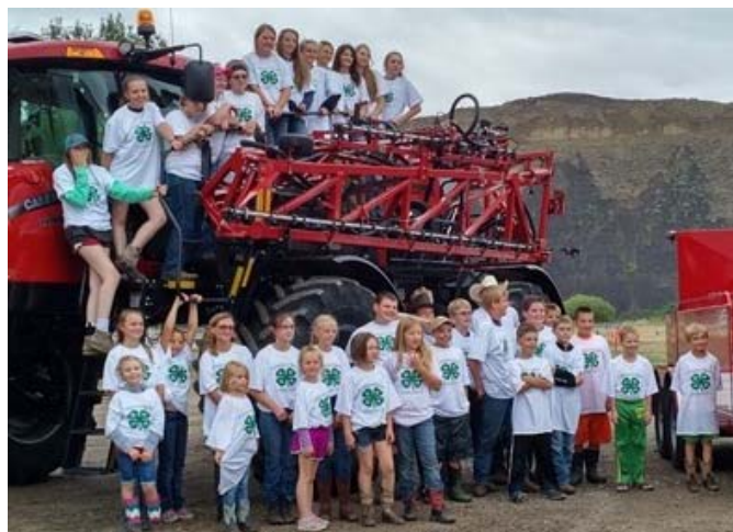
Chouteau County 4-H members posing for a picture with their 4-H shirts sponsored and provided by Havre Torgerson's.

Fifty-three 4-H youth participated in project/demonstration day. Youth developed skills in projects which included entomology, public speaking, cooking and sewing.