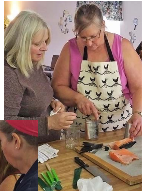
Meat Preservation class participants and instructors.