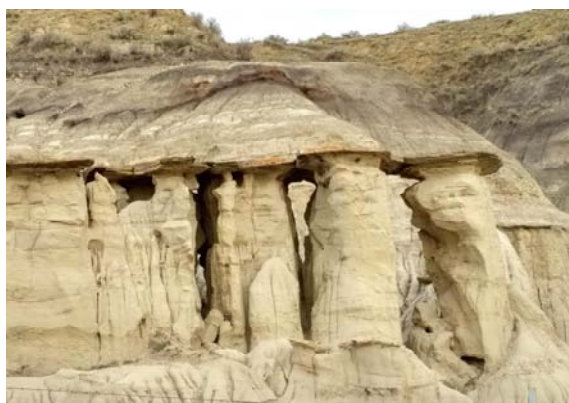
Rock and soil formations in Chouteau County

Fort Benton Recycles was recently named 2016 Recycler of the Year by Recycle Montana.