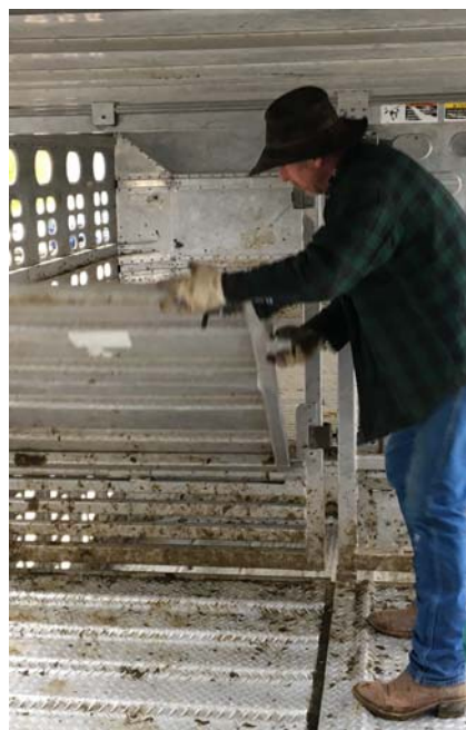
Cattle hauler demonstrating gates and ramps inside the cattle pot.

A cattle semi rollover exercise took place in Fort Benton in an effort to train first responders and others in case of an actual incident involving livestock. The event began with introductions and logistics followed by a functional scenario and break-out discussion groups. Followed by a working lunch, a live cattle hands-on exercise at the